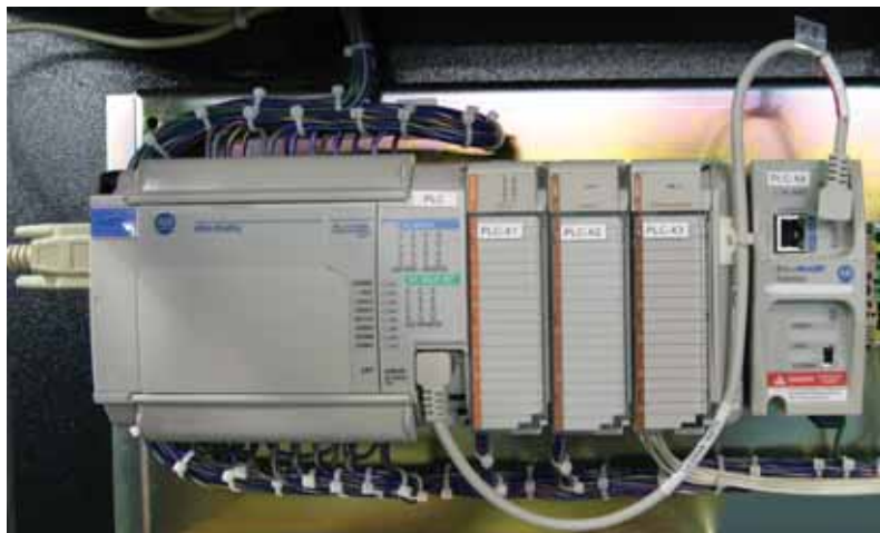
Standard Allen-Bradley PLC. Built in sequencing capability—up to four compressors. Interfacing with plant monitoring systems easily accomplished (optional). (Optional Allen Bradley Ethernet Communication module shown.) PLC manufacturers of customer preference can also be utilized at additional cost.

A separate motor driven oil pump ensures positive lubrication of all gears and bearings prior to start-up, maximizing component life.