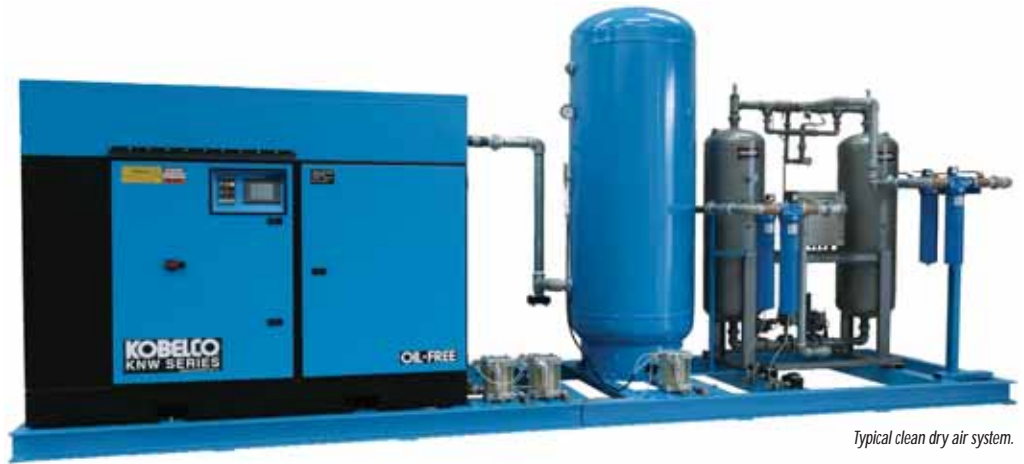
Typical clean dry air system.

To meet the demands and preferences of a wide range of customers and industries, we offer custom packaging of compressors, dryers, filters and receivers. From the simple package shown to projects requiring stainless steel welded pipe, Nema 7 controls, or outdoor weather protection, we can supply it. Packaging greatly reduces on site installation costs and the equipment is tested together.