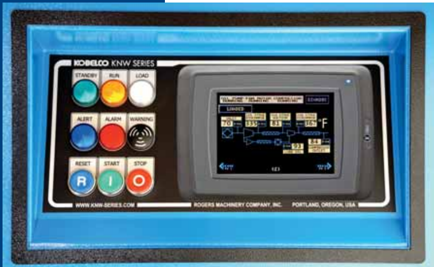
Temperature page shown on touchscreen.