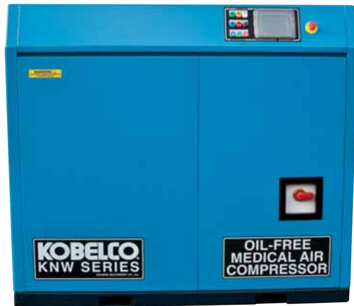
Air-cooled medical air compressor.